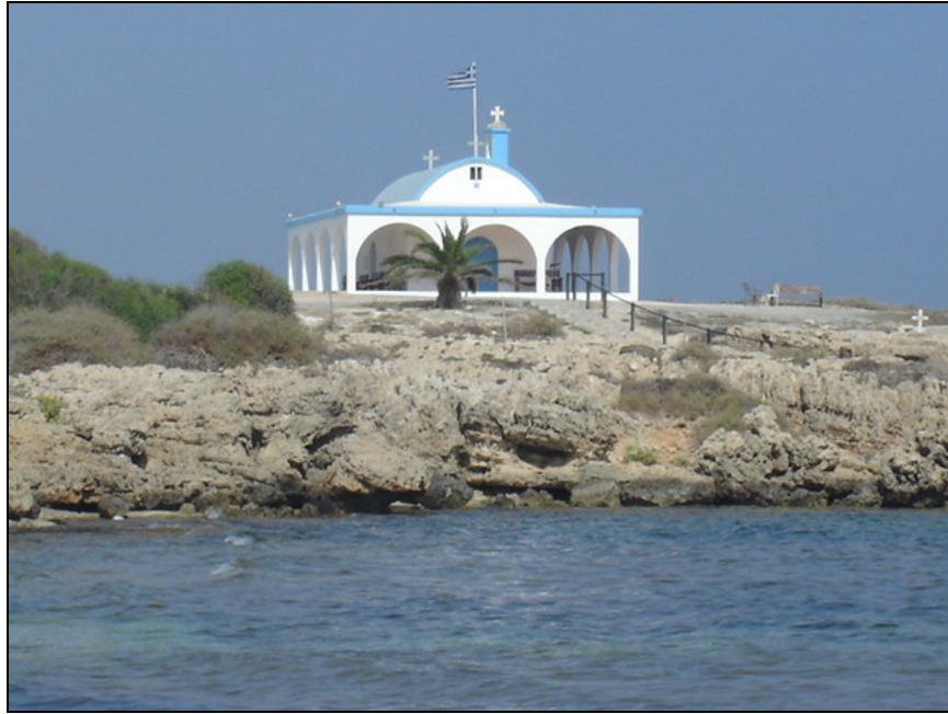
Church at Ayia Thekla near Ayia Napa